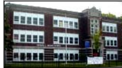
Milner Elementary School: A Weed and Seed Safe Haven

As far west as Westbourne Parkway, and as far east as Ann Street, the Upper Albany/Clay Arsenal (UACA) Weed & Seed program site includes the area between Homestead Avenue and Main Street, from Albany Avenue to Mahl Avenue.